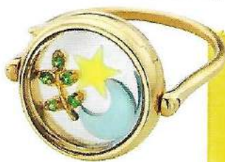
↑ LOQUET Charm ring, £1,400, loquellondon.com

Little luxuries—and a few large ones—that go the distance. By ALICE B-B