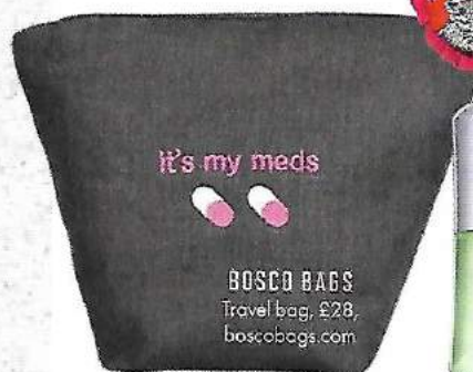
BOSCO BAGS Travel bag, £28, boscobags.com