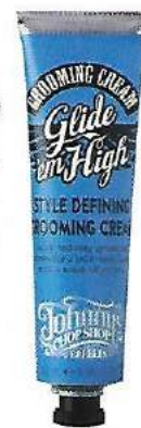
↑ JOHNNY'S CHOP SHOP Glide 'Em High 100ml grooming cream, £5, boots.com