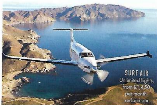
SURFAIR Unlimited flights, from £1,450 per month, surfair.com