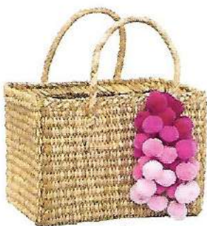
↑ NANNACAY X NET-A-PORTER Wicker basket, £75, net-a-porter.com