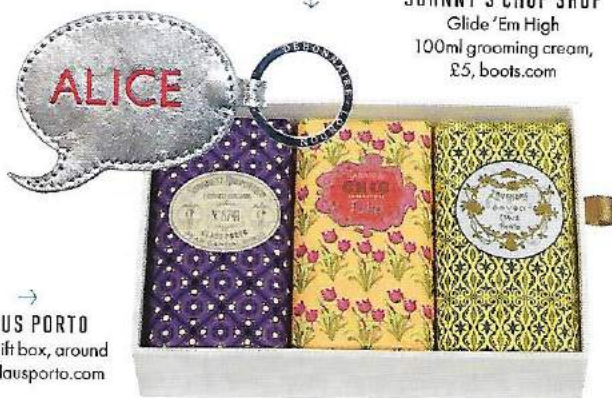
→ CLAUS PORTO Soap gift box, around £35, clausporto.com