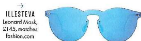
→ ILLESTEVA Leonard Mask, £145, matches fashion.com