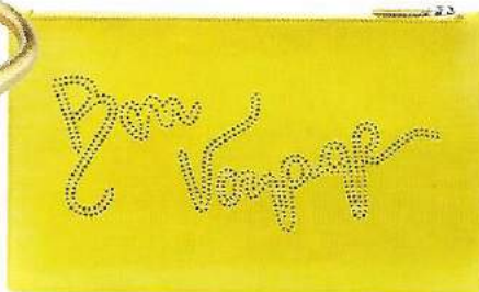
← SMYTHSON Bon Voyage currency case, £295, smythson.com